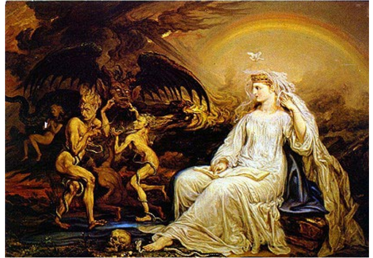
James Ward (1769 - 1859) Miranda and Caliban.